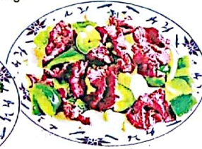
Pepper Steak w. Onion