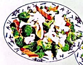
Chicken w. Broccoli