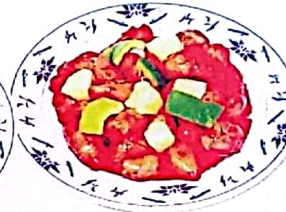
Sweet & Sour Chicken