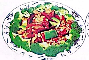
General Tso's Chicken