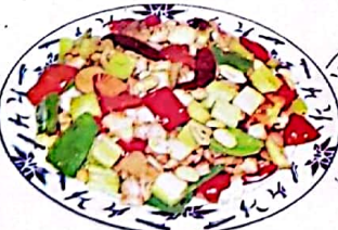
Kung Pao Chicken