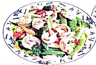
Shrimp w. Mixed Vegetables