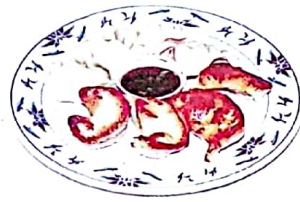
Fried or Steamed Dumplings